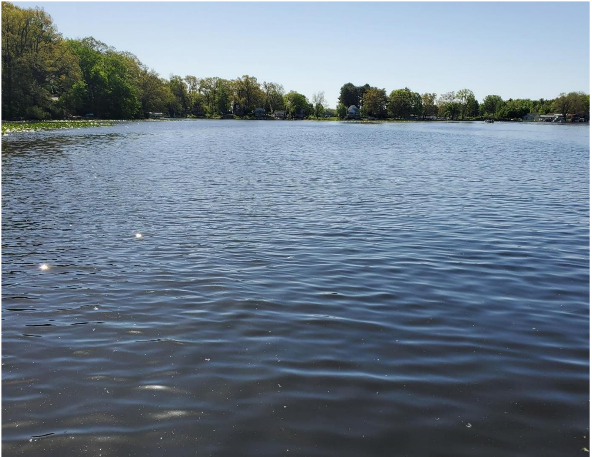
Echo Bay After Treatment (Sorry No Before Picture)