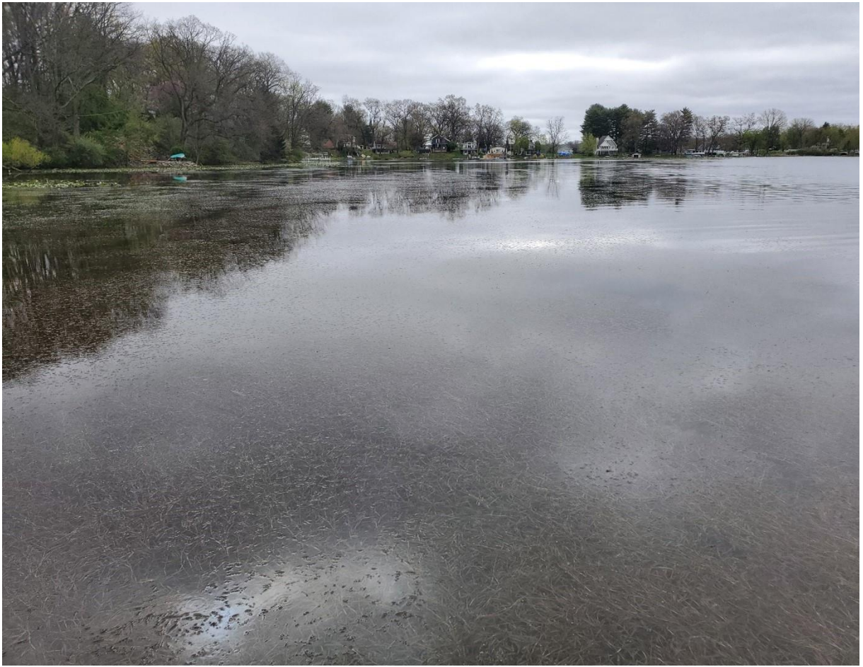
Webster Bay After Treatment